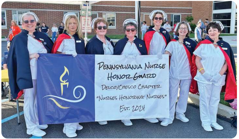
The Nurse Honor Guard marched in the Media Veterans Day Parade.

As the world awakens with spring, it is a fitting time to reflect on the legacies that sustain our community. While spring often focuses on the future, the local chapter of the Nurse Honor Guard honors a lifetime of dedication. Through solemn tributes and selfless service, this group ensures that the “healing light” a nurse carries throughout their career is recognized one final time.