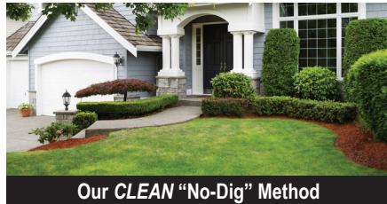
Our CLEAN "No-Dig" Method