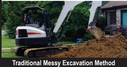
Traditional Messy Excavation Method

The area's ONLY small plumbing company offering in-house trenchless pipe installation and excavation equipment.