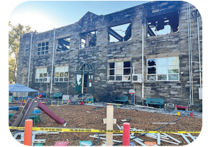
An October fire gutted one of the two school buildings at St. Francis of Assisi.

Saint Francis of Assisi wants to express our heartfelt thanks to everyone who has shown such overwhelming generosity and support.